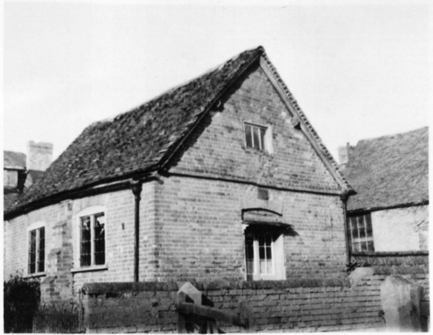
"KEACH'S MEETING HOUSE" Winslow, Bucks